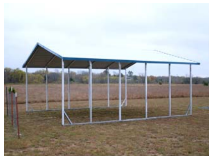
New Shelter Completed At Flying Field

Shade Shelter Damaged By Christmas Storm