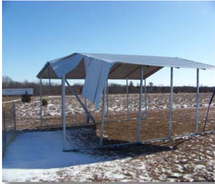
Shelter Damaged by Christmas Eve blizzard.

will be sent out to all club members as the weather permits for a work crew to repair the shelter. 3-5 people should be able to get it back into shape pretty easily so that it's ready to go as we get ready for flying season.