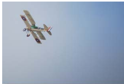
SPAD XIII flies into a fog bank